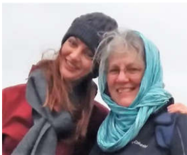
Yes it was cold and windy!